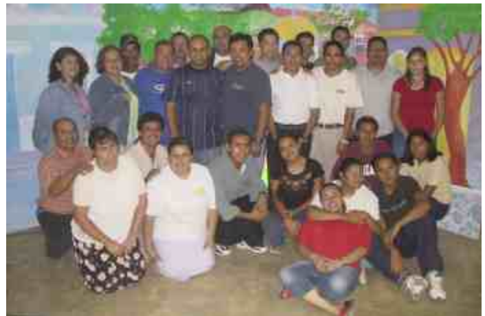
Ministry Training Institute Students, Fall 2004

At this stage in the ministry, we find ourselves faced with the challenge to complete the land transfer. This is an enormous task, but we have an enormous God that is on our side. Our faith is challenged, but we believe that the Lord of the impossible can make things happen.