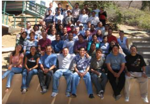
MTI Class of 2007

In the early 1990s, the original Dream Team was assembled to compete in the 1992 Olympics. Since then, according to NBA.com, the Dream Team has left a legacy of being the "greatest team ever assembled, in any sport". So much so, that 15 years later the Dream Team is still a well-known phenomenon, not only in the world of sports, but in everyday life. The intent behind assembling this unbelievably talented group of players was to expose the world to what "basketball at its finest" looked like and to leave no doubt in the minds of fans all over that this team was capable of dominating each and every opponent.